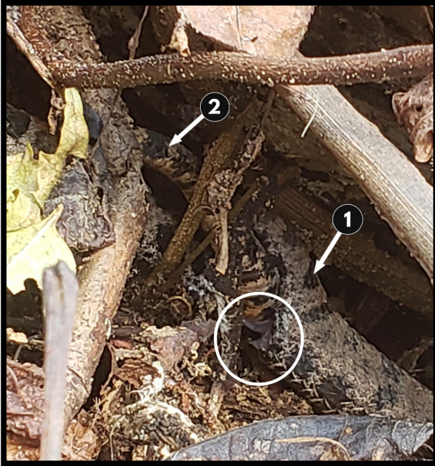
FIG. 3. In situ copulation between unmarked male (2) and marked female (1) Sistrurus miliarius streckeri . The white circle indicates where both individuals are attached by their cloacae.